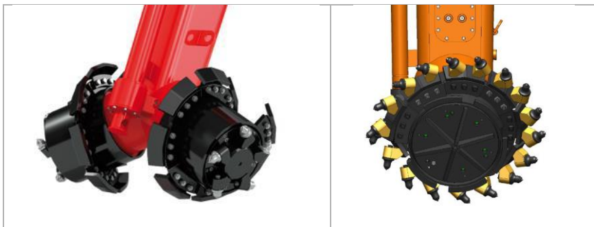
Figure 2-2 Mixing drums of the mixing unit used in mass-stabilization [2]

Depending on the type of mass to be treated, different types of mixing heads can be applied for stabilization work (Figure 2-2). The mixing unit should be able to process at least two different dry binders.