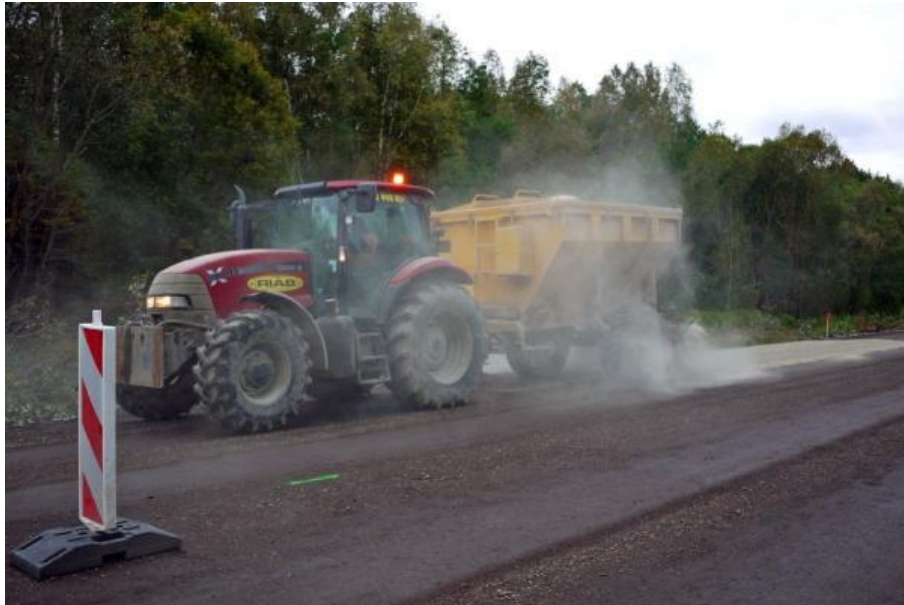
Photo 3-1 Tractor-pulled cement spreading device

In the dry method tractor-pulled cement spreading device is used (Photo 3-1).